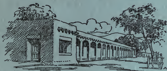
PALACE OF THE GOVERNORS

PUBLISHED QUARTERLY BY THE HISTORICAL SOCIETY OF NEW MEXICO AND THE UNIVERSITY OF NEW MEXICO